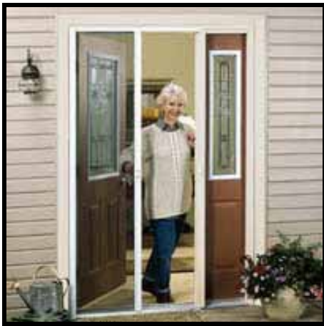
Full View Glass Storm Door

Storm doors must be full-view glass. No screen doors are permitted on the front of homes. However, screen doors are permitted on rear doors of homes, provided that the color matches the exterior of the home. Retractable screen doors are the preferred option. Color pictures and model information of the proposed storm door are to be submitted with the Request for Architectural Approval form.